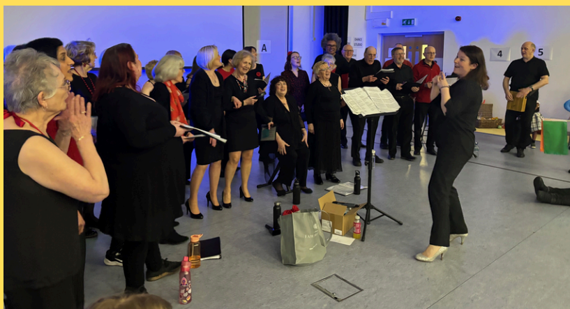
Brandhall Community Choir performing at the AGM in March 2025

The directors have also been active behind scenes, supporting the organisation in a number of different ways. Some examples of this support includes: interviewing potential members of staff, writing policies, meeting with potential volunteers, proof reading and commenting on funding applications, signing contracts and doing finance checks.